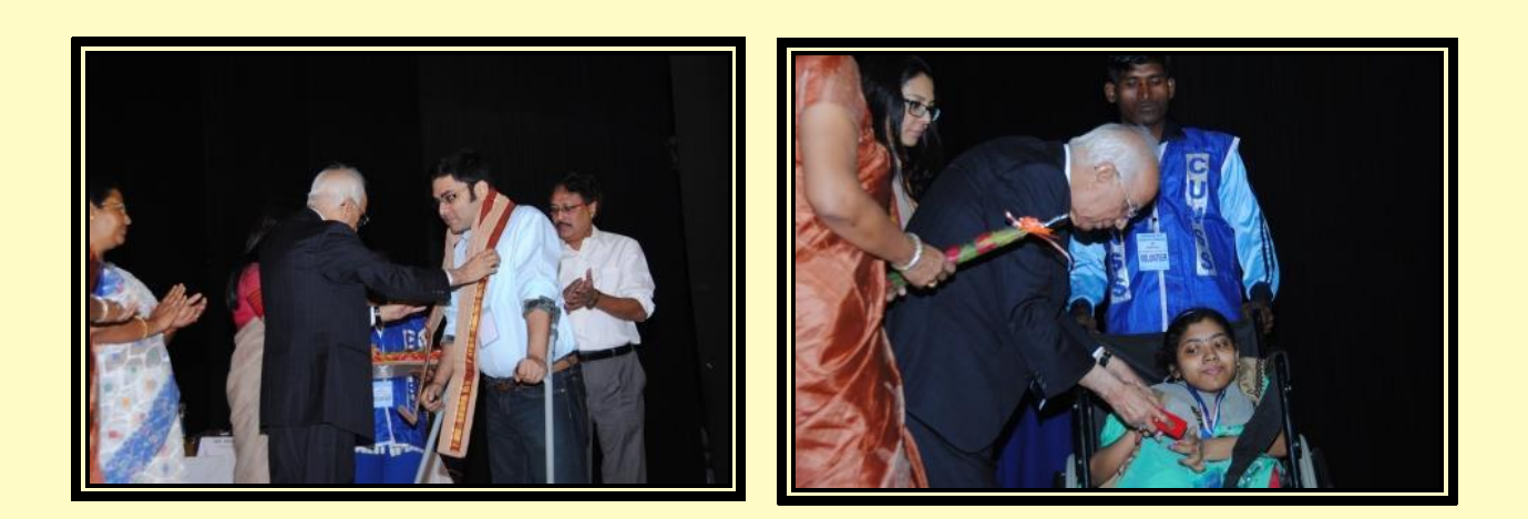
15.2 Glimpses of Cultural Programme on 3<sup>rd</sup> December, 2014